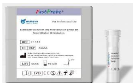
Fast FISH Probe Kit