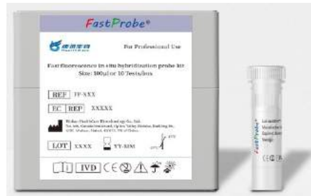
Fast FISH Probe Kit