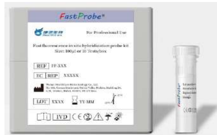
Fast FISH Probe Kit